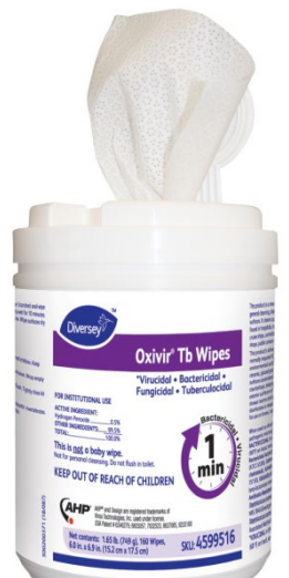
Oxivir® Tb Wipes - Standard EPA No. 70627-60