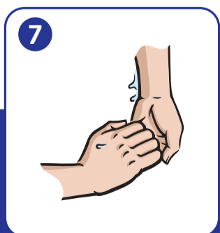
7 With closed fingers