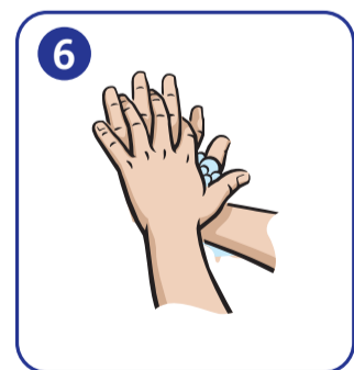
6 Palm to palm with fingers interlaced