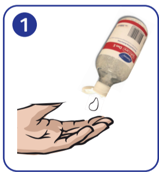
1 Use hand rub