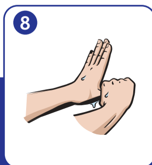
8 Thumbs in hand palm