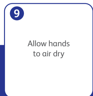
9 Allow hands to air dry